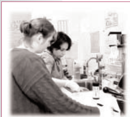
Women's Community Clinic volunteers run a lab test for a client

Many of us lament our faltering health care system, but few envision they can do something to make a difference. This past year MZHF made grants to several small non-profit organizations that are making a difference by providing free or low-cost health care to individuals and families in need