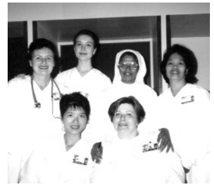
Students completing Jewish Vocational Service's LVN retraining course (from Russia, India, China and the Ukraine), celebrate the end of their clinical rotations.