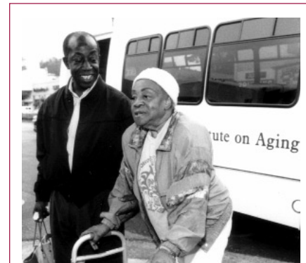
A client arrives at Goldman Institute on Aging's Adult Day Health Care Program. GIOA is undertaking a major building project to consolidate and expand the range of services it provides for seniors.