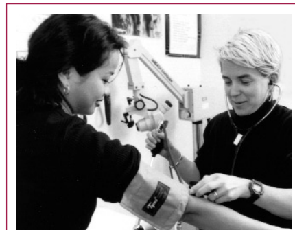
At Huckleberry's Cole Street Program, the new Thursday drop-in clinic has given increasing numbers of at-risk teens access to reproductive health care and HIV testing

Programs to improve the health of persons with HIV/AIDS were the focal point of several grants. A media